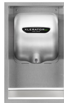
Part # 40502