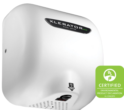
XL-BW-ECO White Thermoset Resin (BMC)

MODELS: XL - BW W GR C SB SI SP - ECO OPTIONS: -1.1N (Noise Reduction Nozzle) -H (HEPA Filter) -VOLTAGE (See Chart)