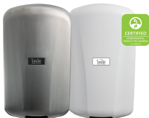
TA-SB Brushed Stainless Steel

MODELS: TA - ABS W GR SB SI SB-SI SP OPTIONS: -H (HEPA Filter) -VOLTAGE (See Chart)