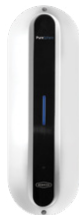
PureSphere Air Sanitizer

The workplace benefits of PureDri Sanitizing Hand Dryers for your restrooms and PureSphere Air Sanitizers for every room in your facility: