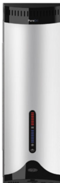
PureDri Sanitizing Hand Dryer

Combining photocatalytic disinfection, germicidal irradiation, and dual waveband UV, our best-in-class technology decontaminates both air and surface for the purest, freshest environment possible.