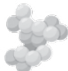
Bacteria like Staphylococcus

92.17% air disinfection efficacy after 1 hour. 1