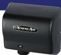
Steel Black Graphite