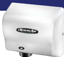
Steel White Epoxy