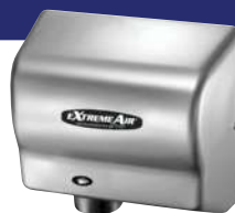
Steel Satin Chrome