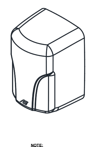
ALL DIM'S INCH [MM]

ILLUSTRATION FOR REF ONLY AND NTS FOR CLEANING INSTRUCTIONS SEE APPROPRIATE SECTIONS IN PRODUCT CARE & MAINTENANCE BULLETIN (PCM) ON ASI WEBSITE